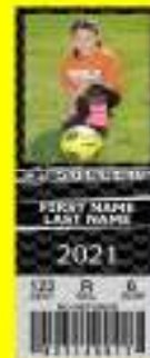
Ticket & Magnet